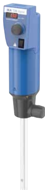
T 25 digital